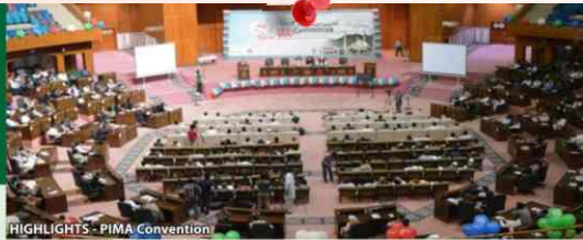
HIGHLIGHTS - PIMA Convention

The 23 rd international convention of PIMA was held on 5 to 6 April at Jinnah convention centre Islamabad. It was attended by more than 2000 delegates from Pakistan, with delegates from Bangladesh, America, Malaysia, Indonesia and Afghanistan. The basic aim of this 2-day convention was to enlighten doctors with up-to-date knowledge in various fields of medicine, and to guide doctors on character building according to Islamic principles entailed in the Quran and Sunnah.