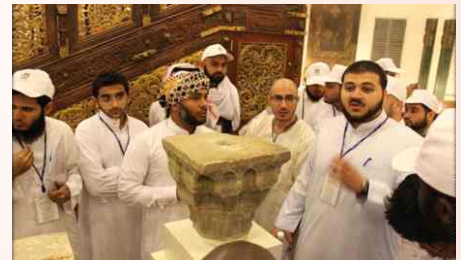
Alharam Museum, Makkah