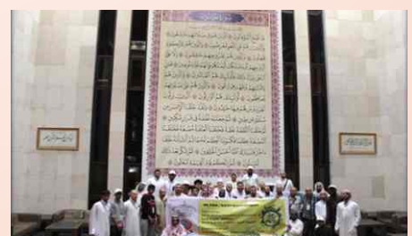
King Fahad Qura'an printing complex, Madinah