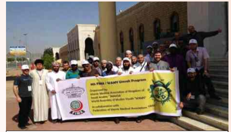
Masjed Namirah, Makkah