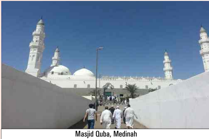
Masjid Quba, Madinah