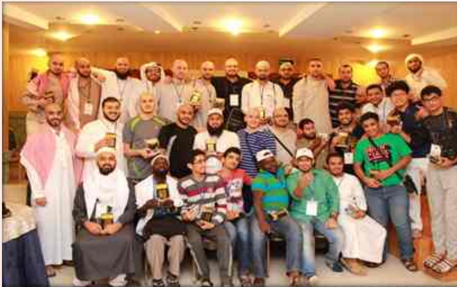
Committee of Haram Delegation (WAMY social activity), Makkah