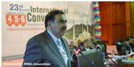
HIGHLIGHTS - PIMA Convention

Surgery, Neurology, Gastroenterology / Hapatology, Cardiology, Mother and Child Health, Pain Management, Hypertension, Dentistry, Musculoskeletal disorders, Infectious Diseases, Nephrology, Diabetes, Ophthalmology, and free papers sessions (in which 12 doctors presented their papers).