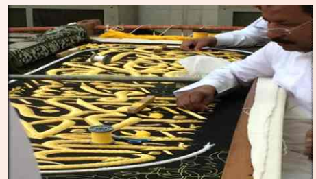
Kiswah Factory, Makkah