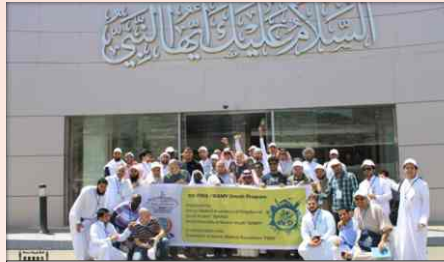
Alsalamu alyka Ayuha Alnabi Project, Makkah