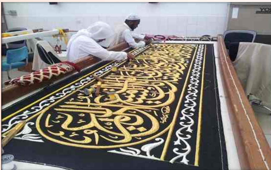
Kiswah Factory, Makkah