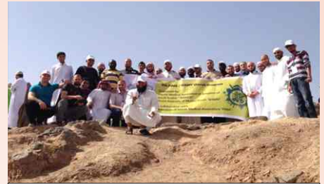
Jabal Alrumah (Archer's mountain), Madinah