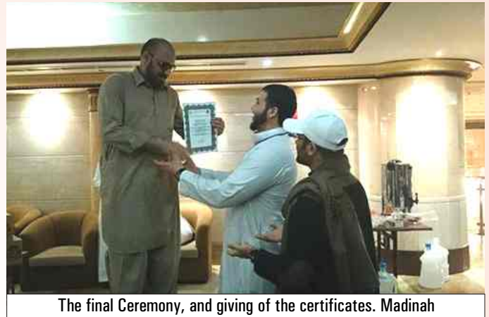
The final Ceremony, and giving of the certificates. Madinah