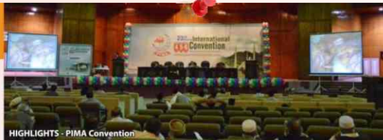
HIGHLIGHTS - PIMA Convention

He said that in an Islamic society progress in health and education was always achieved through spending in the way of Allah (انفاق). He said that Allah SWT had given standards for the good and bad to all humans. This understanding of what is good and bad is inborn. The person who remembers Allah on all occasions and who keeps this standard in mind all the time is held to be wise. Spending in the way of Allah is a result of this remembrance of Allah on all occasions.