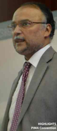
HIGHLIGHTS PIMA Convention

Prof Ahsan Iqbal in his speech presented the next five year health and education plan. He announced that spending on education and health will be doubled in the next five years and that steps to create awareness about diseases through campaigns would be carried out. He urged doctors to strive for concrete activities so that heart diseases, diabetes and hepatitis etc. are brought under control.