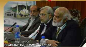
HIGHLIGHTS - PIMA Convention