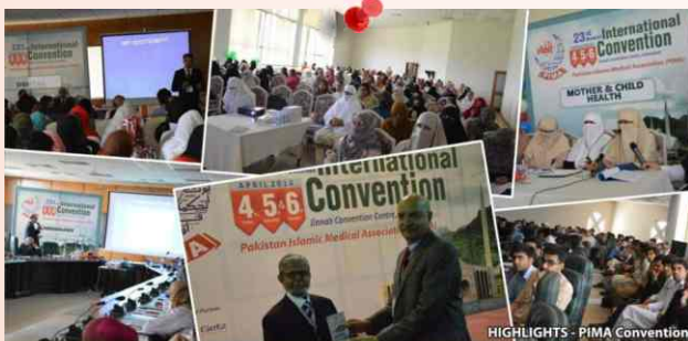
HIGHLIGHTS - PIMA Convention

Eighteen scientific sessions were arranged by highly experienced doctors who enlightened participants up-to-date in the various fields of medicine. In addition, lectures on Islamic teachings and character building for doctors were also arranged by scholars. The theme of this convention was وہدیت الحکمہ فقہاوتی خیر اکثر