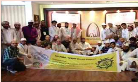
Reception in Makkah al Mukaramah

bonding and interaction amongst the Muslim medical students from all over the world.